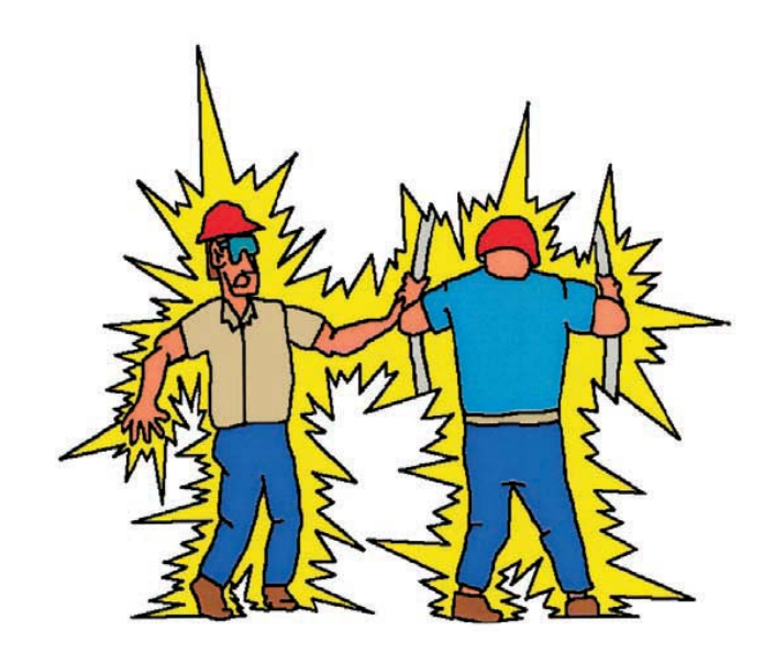
DON'T TOUCH someone who is being zapped with electricity!