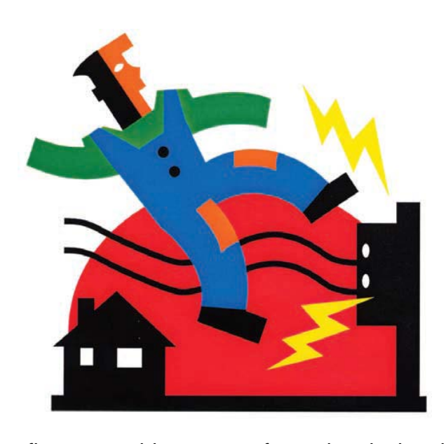
Keep fingers or objects away from electrical outlets.