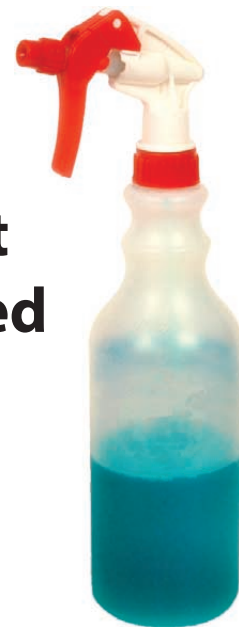
Bottles that aren't labelled