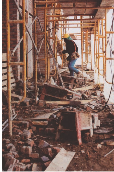
Messy work areas